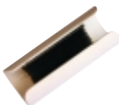
White brush for use on aluminium. Cat number: SB3